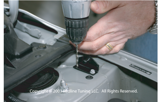
Copyright © 2003 Redline Tuning LLC. All Rights Reserved.