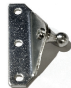
2006+ Hood bracket