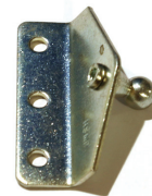
'02-'05 Hood bracket

B. Holding bracket in place, mark the center of the lower hole using a permanent felt tip marker. Be sure the bracket is straight and sitting flat against hood's under structure. Set bracket aside. Using a center punch and a hammer, tap the center of the mark you just made (this indentation will help guide the drill bit and keep it from wandering).